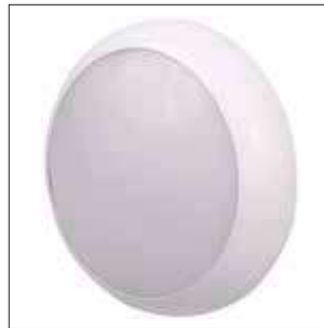
Skirt also available in black