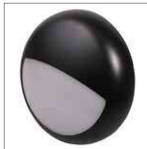
Eyelid also available in white