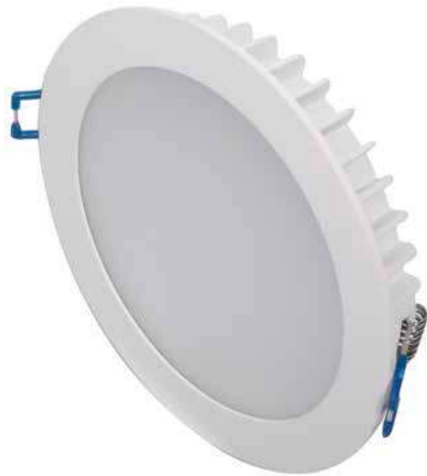
SAPPHIRE LEDLITE LP

LOW PROFILE LED RECESSED DECORATIVE CIRCULAR LUMINAIRE FOR INTERNAL APPLICATIONS