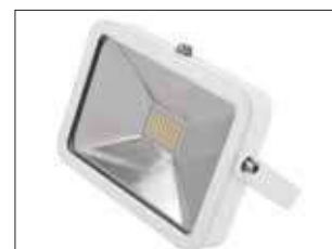
Also available in white

The comprehensive range starts at just 10 Watts extending through to 50 Watts and fitted with the latest technology in driverless single high output multi lamp LEDs that are driven directly at 230/240V.